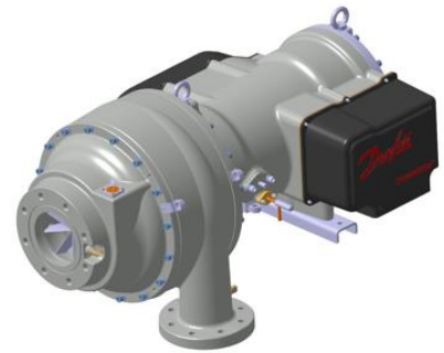
Downward Discharge Rotated 90°

We do not permit any discharge modifications once the compressor has left our manufacturing facility. Any modifications made after it has left the Danfoss manufacturing facility will damage the compressor and will void the warranty.