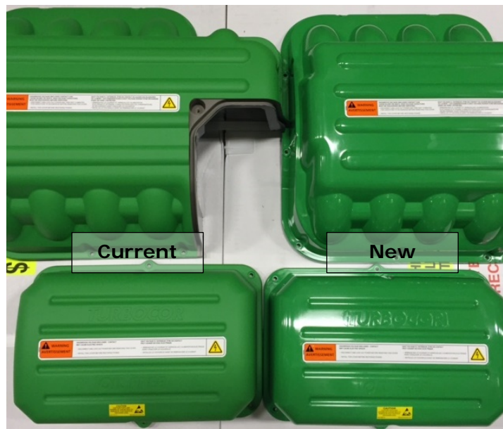
Figure 1 - Current vs New TG Covers

The actual color of the TG "green" color (Pantone 363C) has not changed with this change in process.