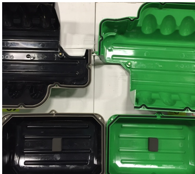
Figure 3 - Current Black vs New TG Cover