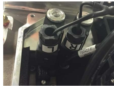
Figure 2 - Left & Right Label