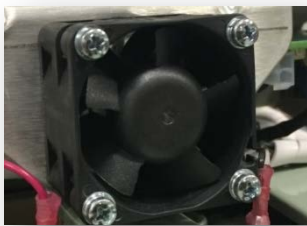
Soft Start Fan

All Danfoss Turbocor TT and TG Series compressors have a Soft Start fan which is the same across all models. The purpose of this fan is to provide air circulation in the top side electronics compartment.