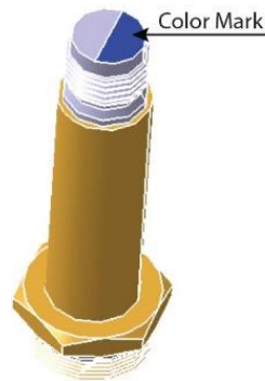
Figure 2 - Plunger Color Mark

The plunger with the new seal will have a blue mark on the back of it (current production is green and original production had no marks). Refer to Figure 2 for the location of the color mark.