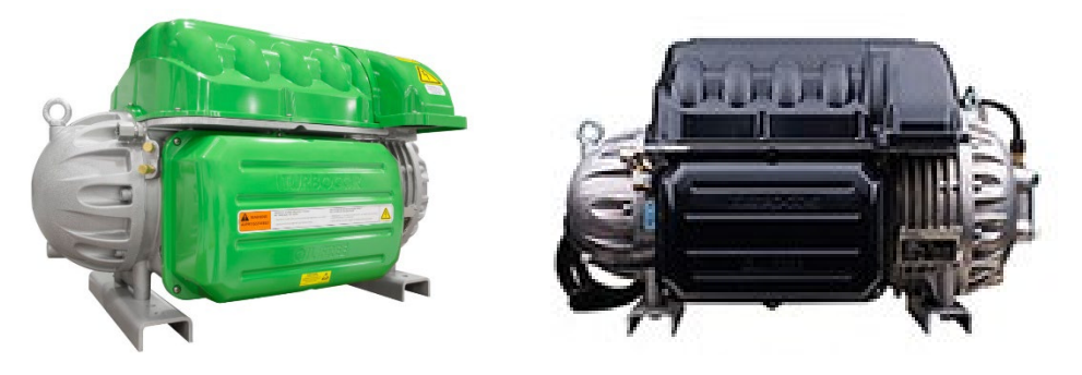
Figure 1 – TGS and TTS Compressor Examples

These compressors are equivalent to the compressors manufactured in Tallahassee, FL USA except for the nameplates and boxes which are for compressors manufactured in Haiyan, China and will include both Chinese and English language.