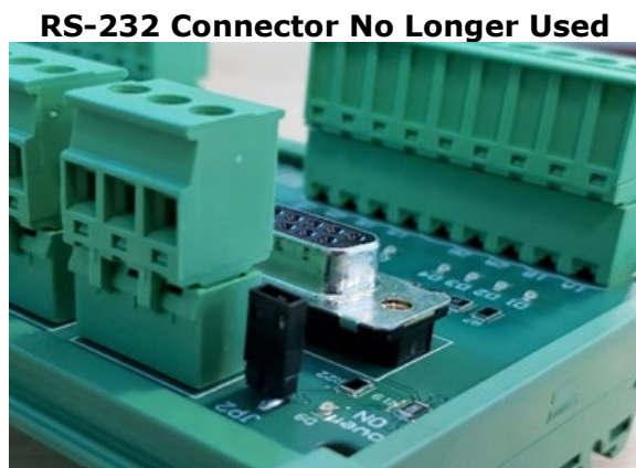
Figure 1 – J7 Connector Comparison

This is to inform our customers that one of the alternate components for the TT Series I/O Board assembly is no longer used. Following extensive testing, we found that the RS-232 J7 connector did not meet some customer expectations. Though the component is fully functional, if not handled correctly, the connector could pull away from the printed circuit board (PCB) during the removal using some brands of serial cables. All alternate connectors now mechanically attach to the PCB to increase stability and retention force to prevent detachment.