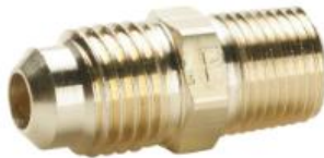
Figure 2 – Sample Fitting