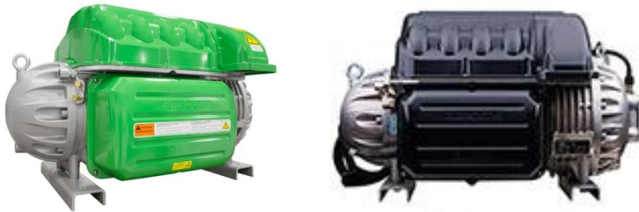
Figure 1 – TGS and TTS Compressor Examples

This update reflects our continued commitment to meeting global voltage requirements and expanding flexibility for our customers.